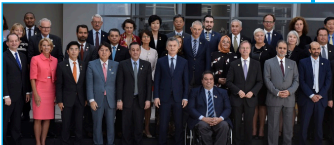
Education and Employment Ministerial Meeting 6 September, 2018 / Mendoza, Argentina